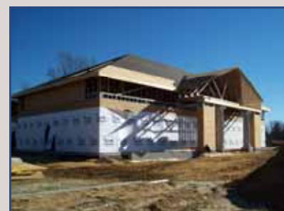
Johnsonville Library Johnsonville, SC