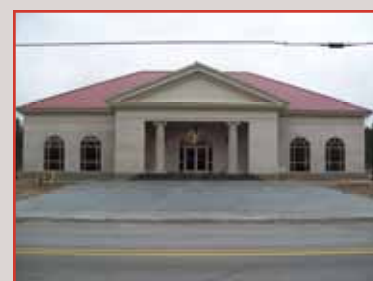
Timmonsville Library Timmonsville, SC