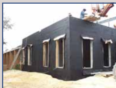
St. Luke United Methodist Church Bennetsville, SC